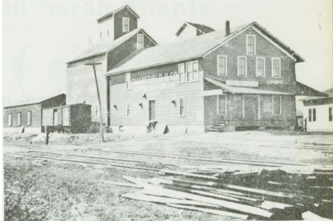
Mansfield Elevator in Remus in 1907